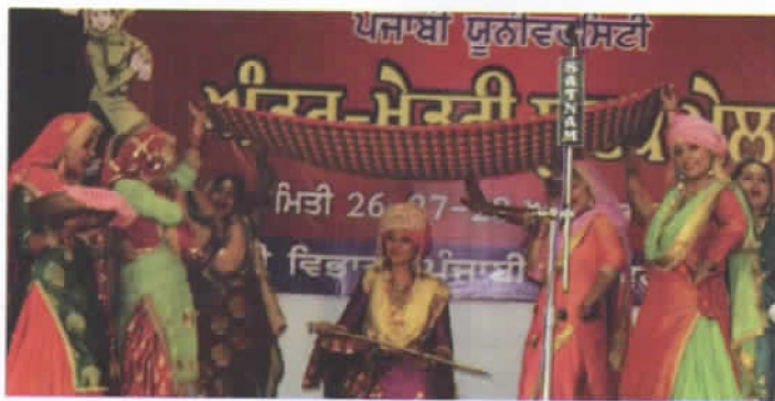
Our College Giddha Team that won 2nd Position in Inter Zonal Youth Festival