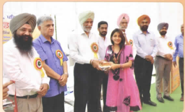
S. Surjit Singh Rakhra, Minister of Higher Education and Languages, Govt. of Punjab, giving away prize to meritorious student at Annual Prize Distribution Function-2015.